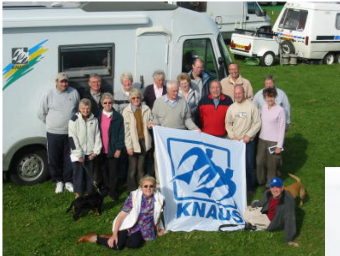
A DIFFERENT VIEW OF OUR HAPPY GROUP AT YORK, just 9 of our vans in the midst of 4,000 others!