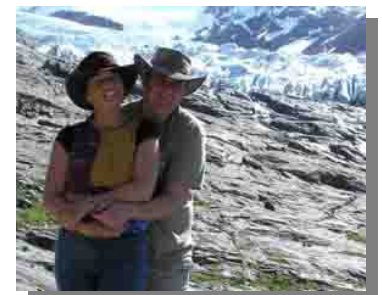
Above: Svartisan Glacier